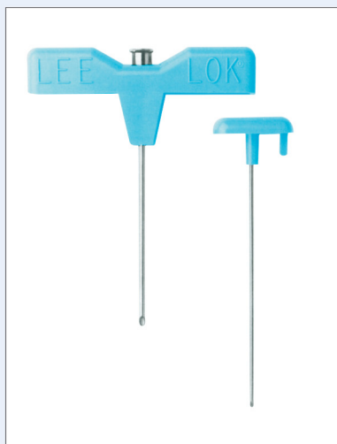
LUER-LOK ™ Hub & One-Piece Stylet